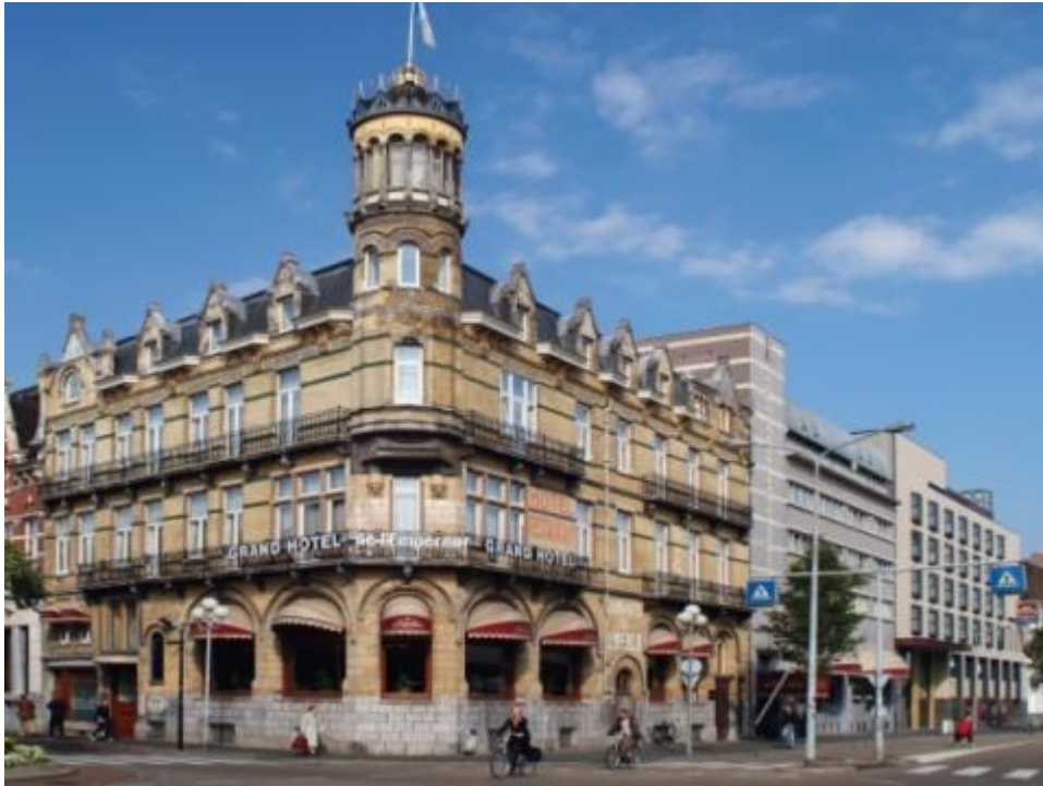
Amrâth Grand Hotel de l'Empereur